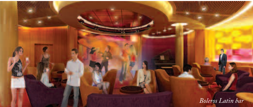
Boleros Latin bar