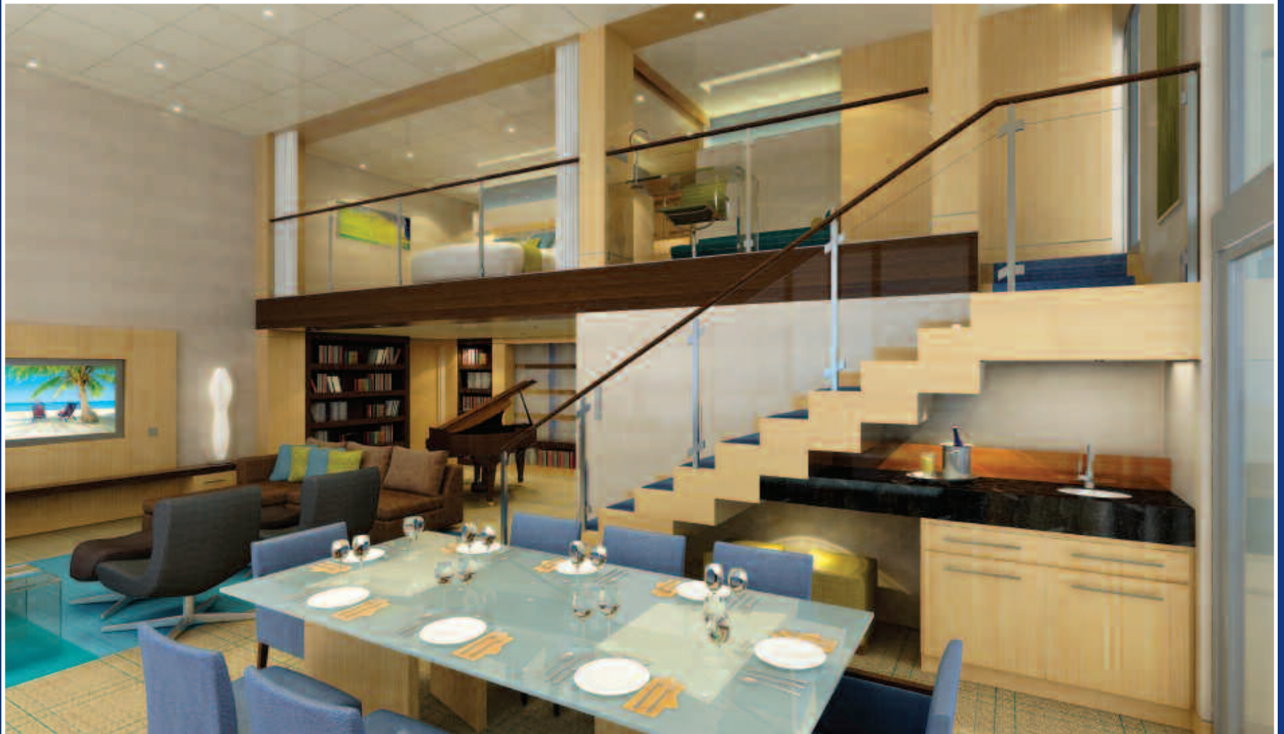
Royal Loft suite