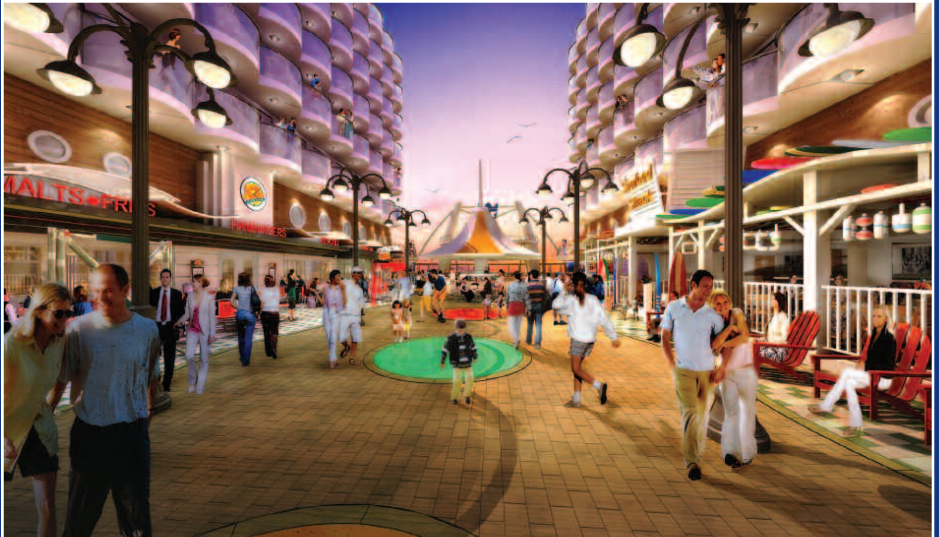
Boardwalk looking aft