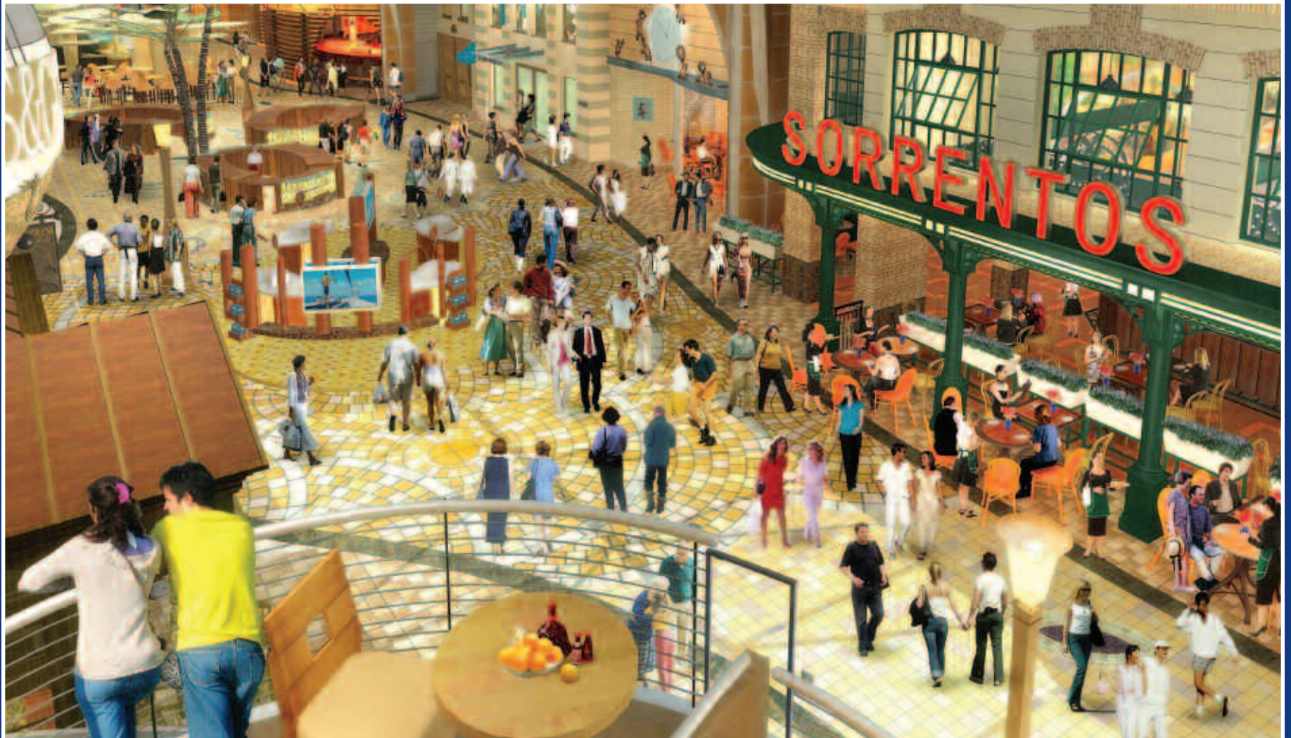
View of the Royal Promenade from the mezzanine