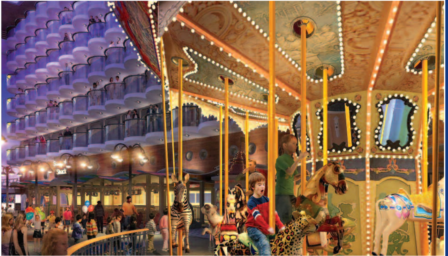
Boardwalk View Balcony Staterooms overlooking the Carousel and Boardwalk