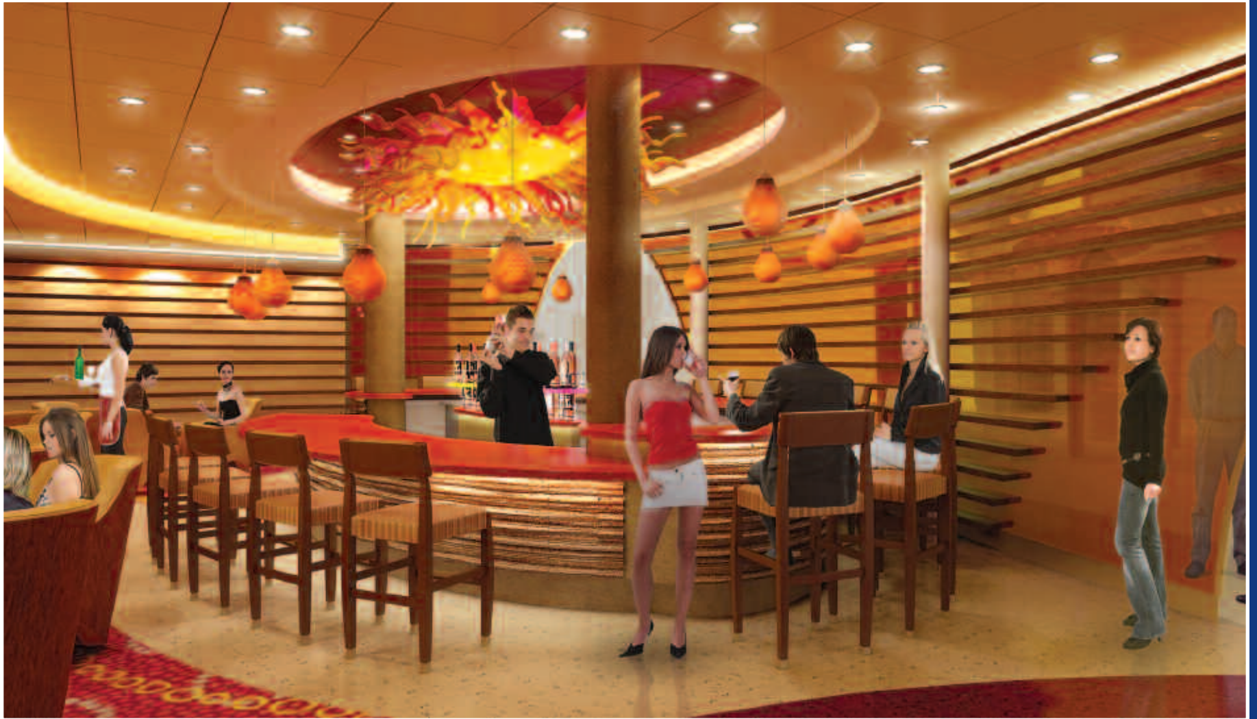
Boleros Latin bar