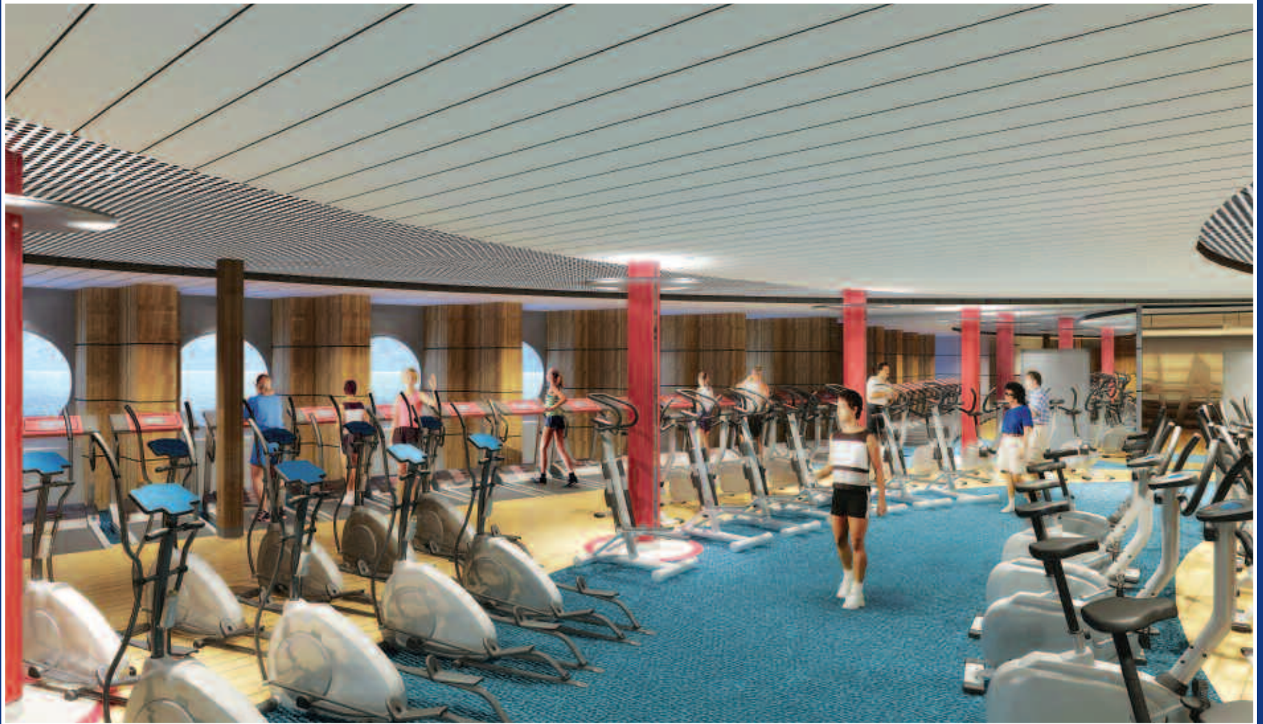
Vitality at Sea Fitness Center