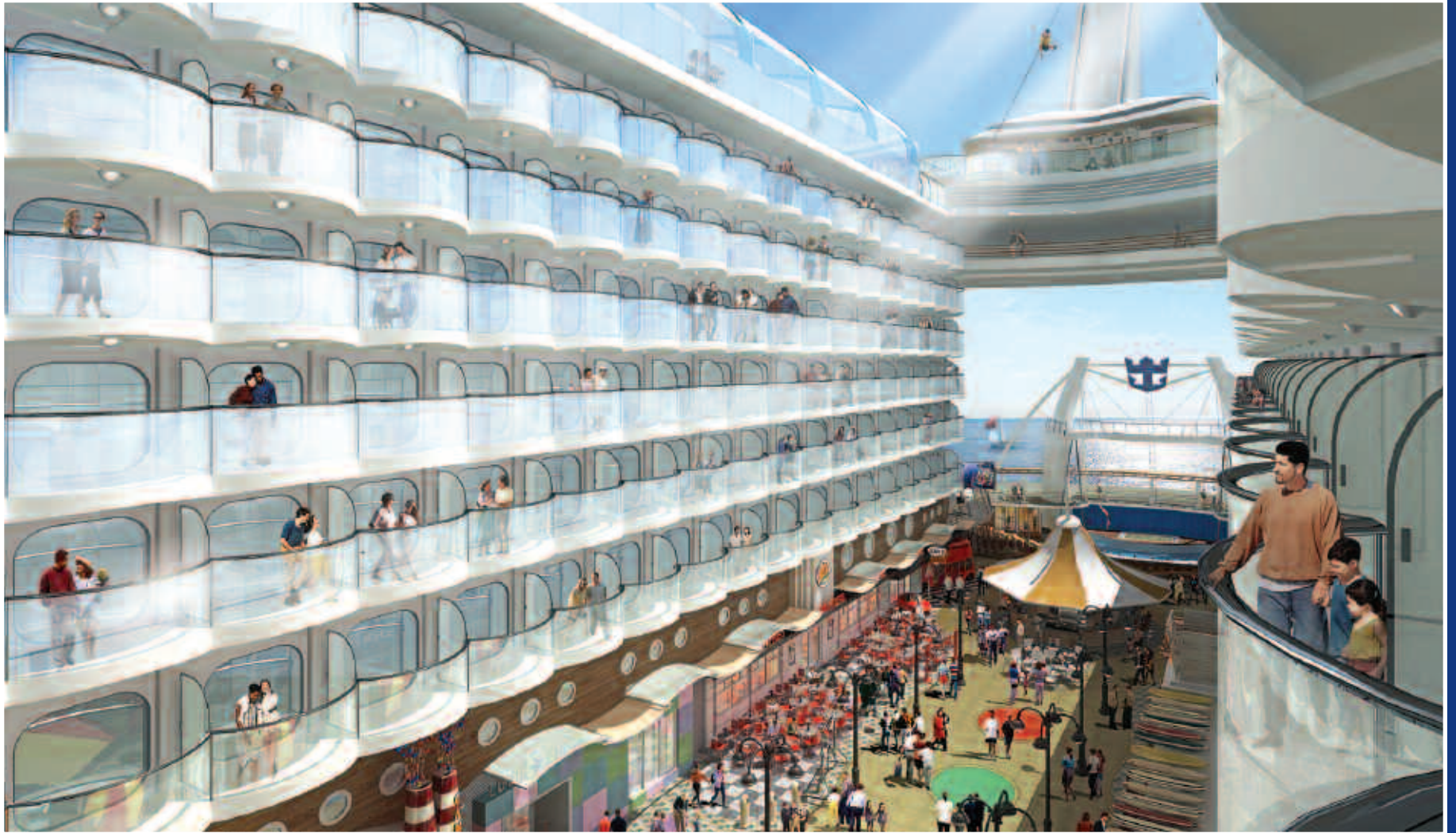
Boardwalk View balcony staterooms