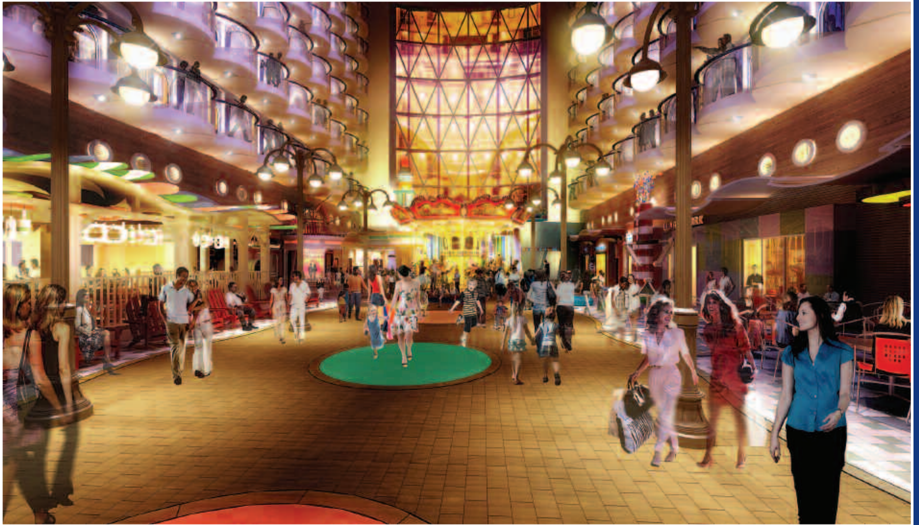
Boardwalk looking forward