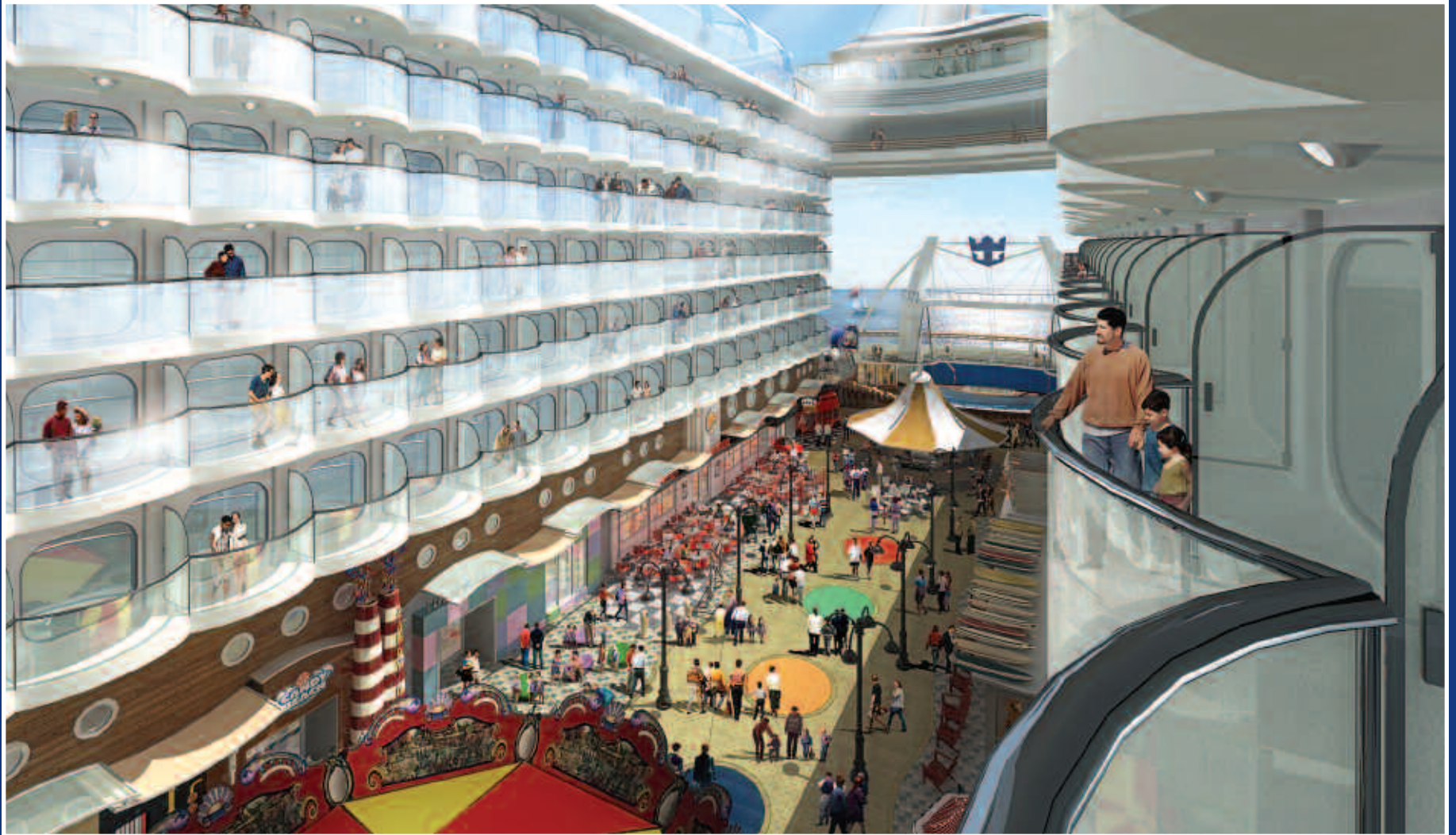
Boardwalk View balconies