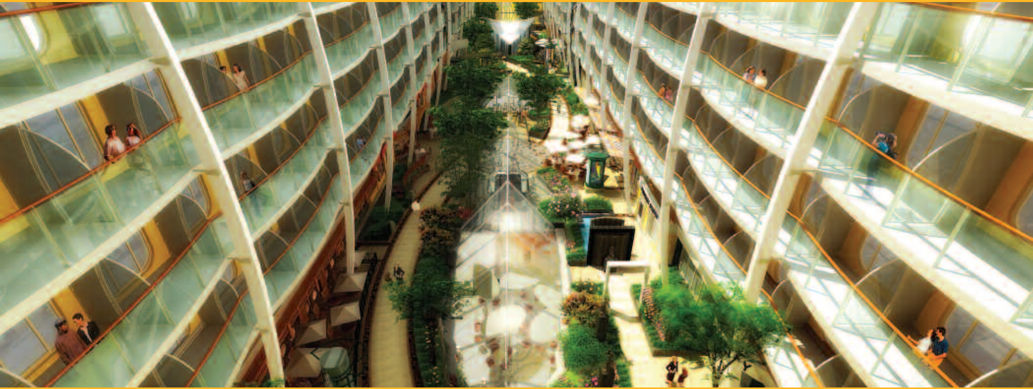
Central Park View balcony staterooms