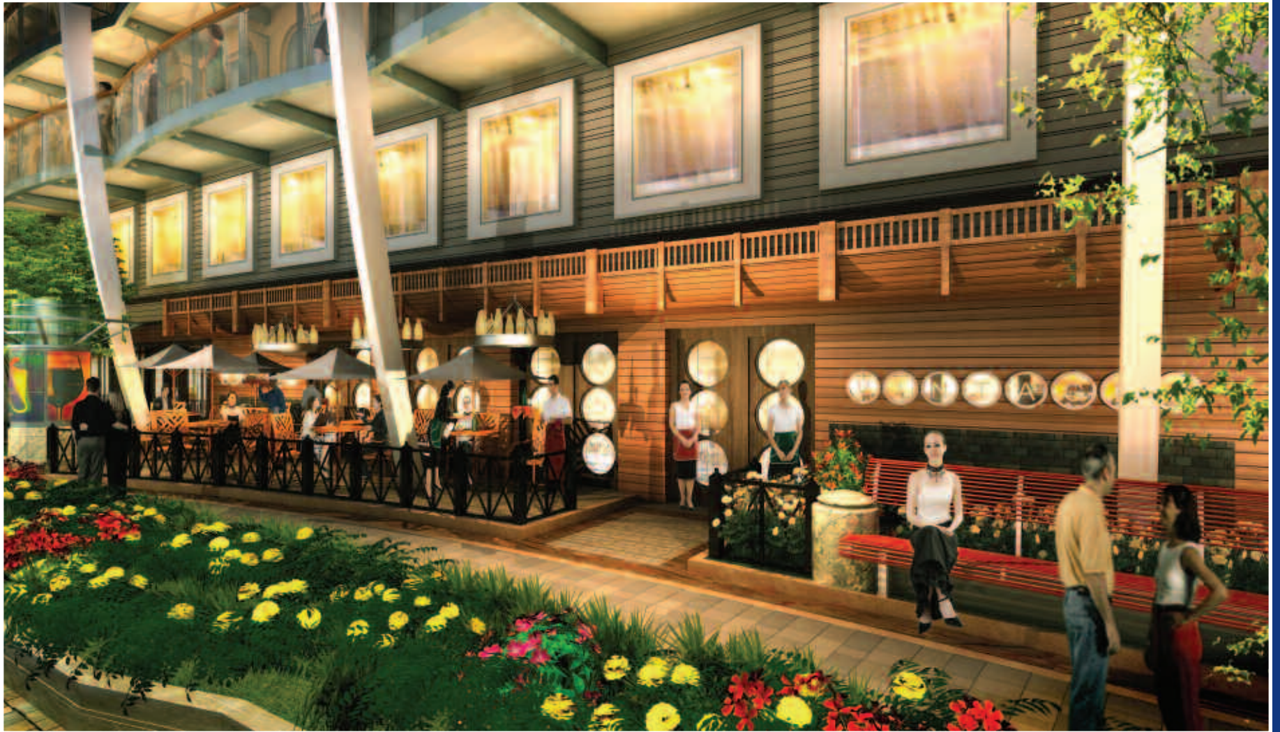
Vintages wine bar