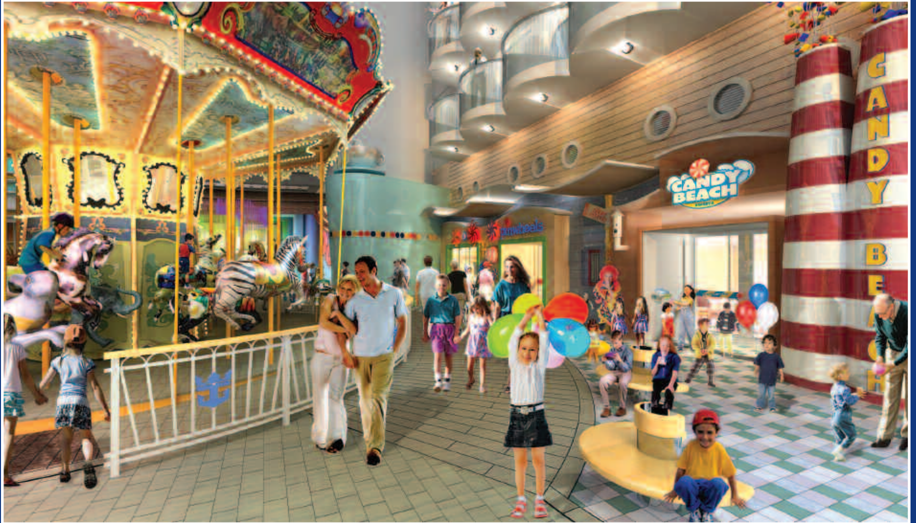
The Carousel and Candy Beach