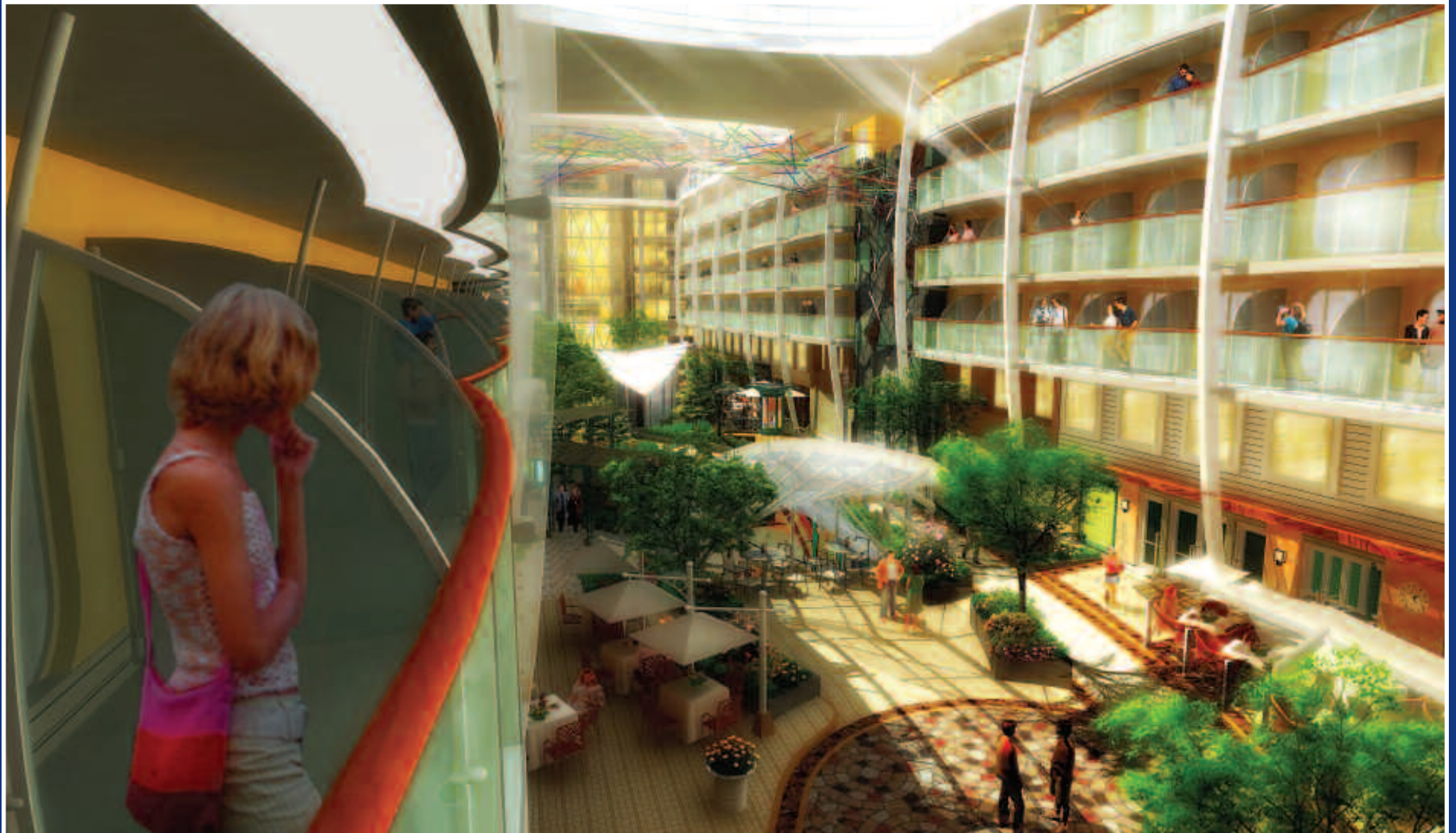
Park View balcony staterooms overlooking Central Park