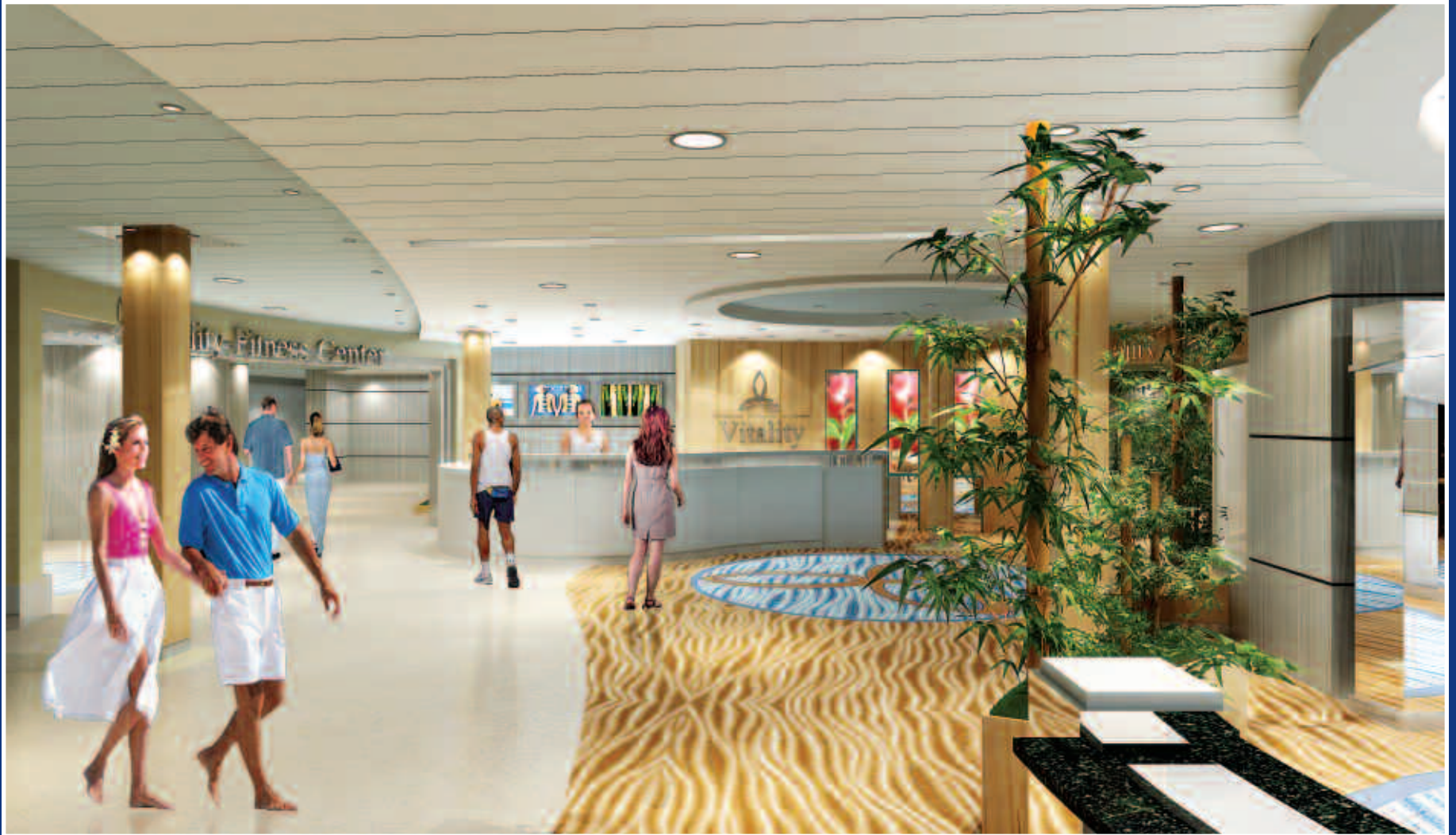
Entrance to Vitality at Sea Spa & Fitness