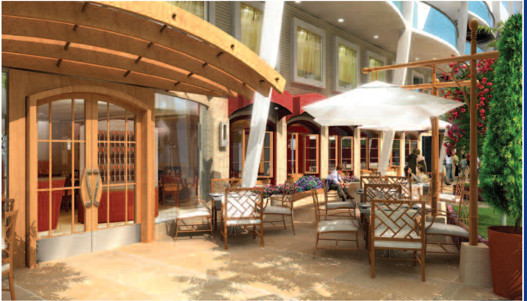
Antonio's Table Italian trattoria