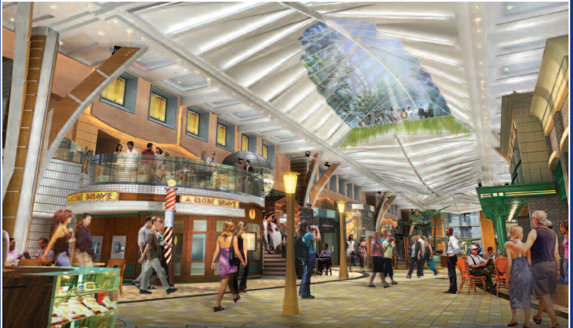
Royal Promenade featuring a Crystal Canopy skylight