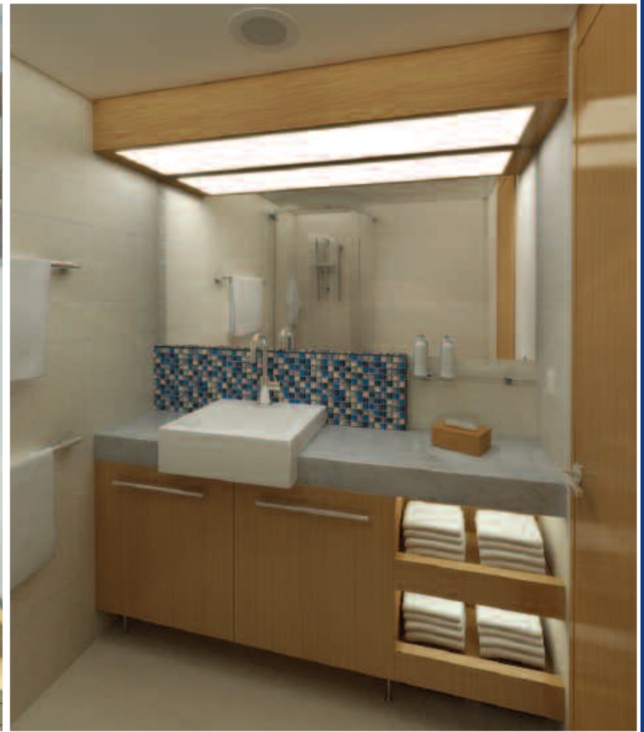
Crown Loft suite balcony, and bathroom