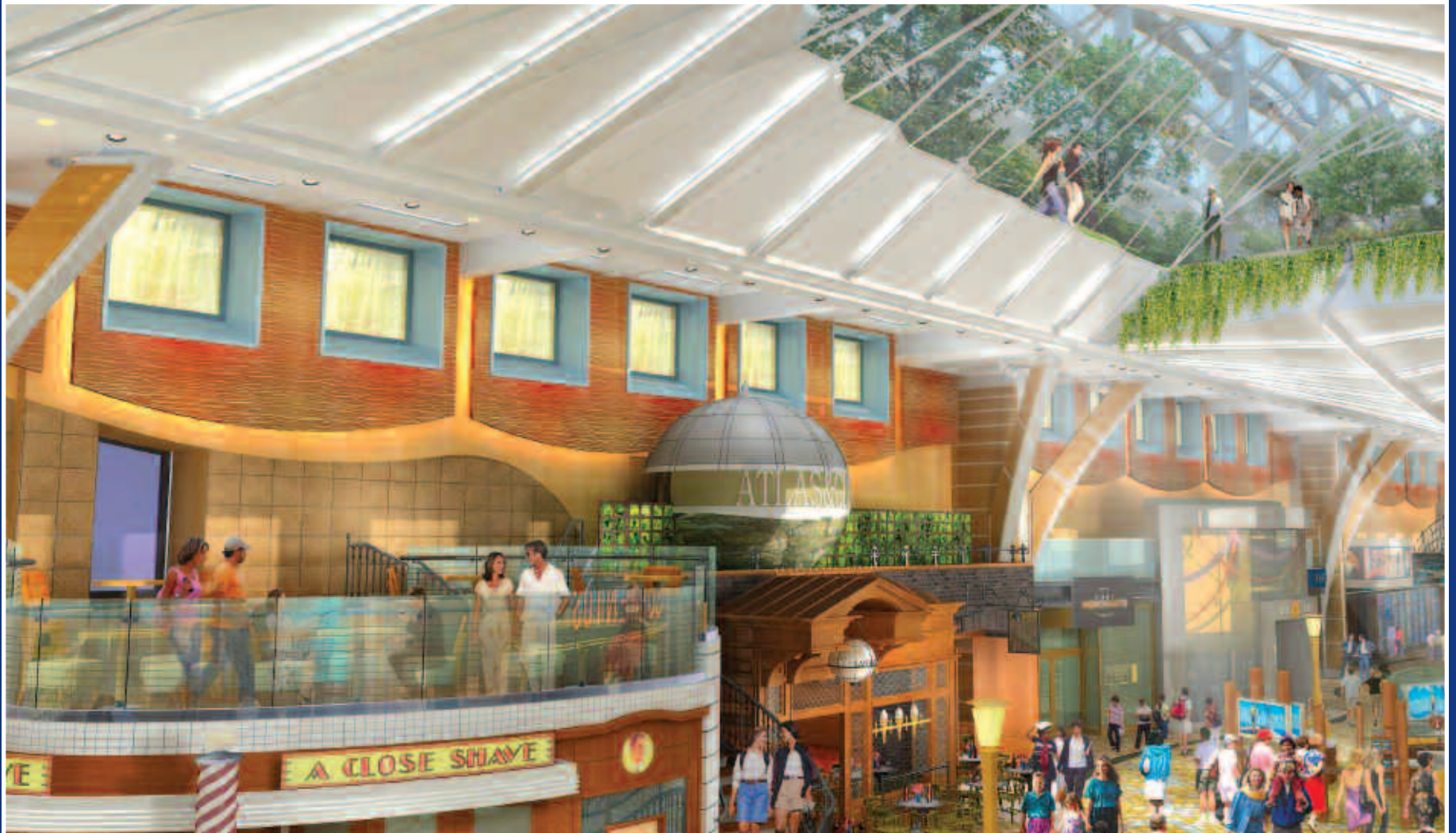
Promenade View staterooms